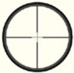
Rifle Scope Reticle