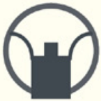
Aperture rear sight, post front sight